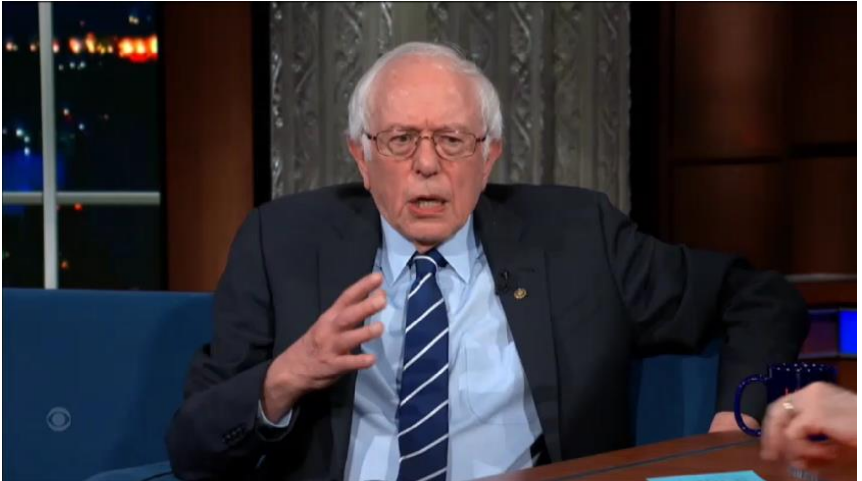
Vermont senator Bernie Sanders on a 2023 episode of The Late Show with Stephen Colbert talking about pharmaceutical company paid lobbyists in Washington, DC